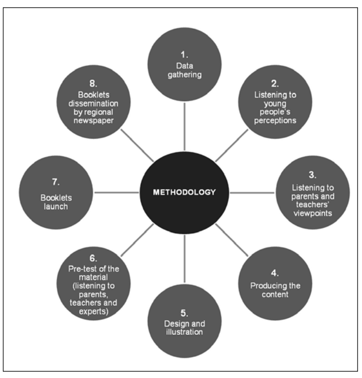
Figure 5. The project methodology.

In this project, media literacy was understood «in a context of empowerment and human rights» (Livingstone, 2011: 417), namely children's rights to participate, express their opinions and be informed, as advocated by the Convention on the Rights of Children. The core idea was to provide resources that empower citizens, young people and adults to deal critically with media, either traditional or new. As Livingstone stated, «it is certain that most cultures hope children will be critical media consumers, though not all provide, or can provide, the educational resources to enable this»