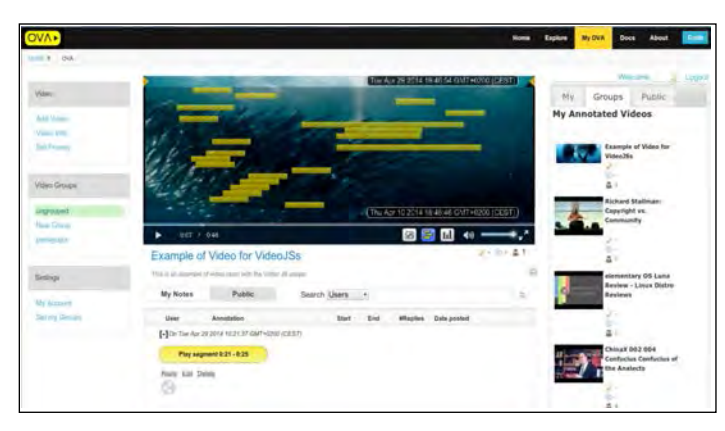
Graph 2: Multimedia annotation tool.

At the second stage, during the second half of 2013, a new Open Video Annotation (OVA)<sup>5</sup> was created (image 2), which responded to an interactive and communicative teaching model in the MOOC. The creation and design of this tool was guided by the HarvardX annotation manager, and included the following features: a) Editing entries could be done in a multimedia format (video, text, image, etc.). b) Multimedia annotations could be added within the resource