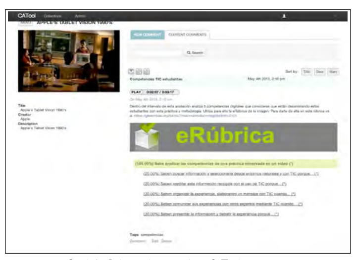
Graph 1. eRubric tool integrated into CaTool annotations...

The present project started from the mutual interest shared by our team and HarvardX Annotation Management in creating tools to facilitate meaning processes based on collective multimedia annotations. The general aim of the project was to create a new tool for multimedia annotations specifically designed to