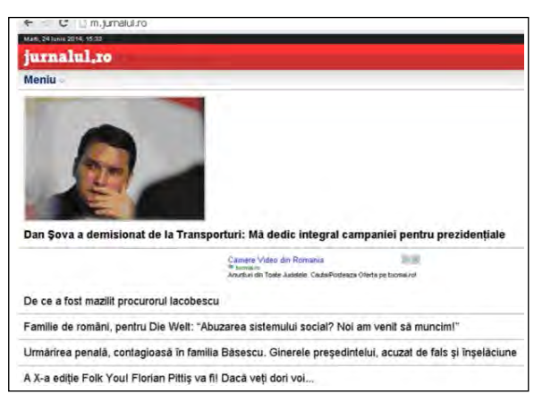
Figure 2. Layout with text - title as link.

The structure of the mobile site refers to the number of items (mobile news – content provided by pro-