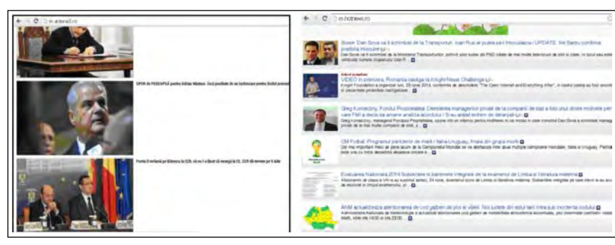
Figure 1. Layout with photo, text - title as link.

The aspect of convergence which is the multimedia format of the mobile news is manifested in a content that consists more in texts and photos. The analysis found three groups of mobile sites. A group uses only text for the list of their mobile