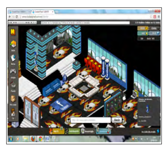
Figure 2. Example of «virtual world advertising».

ment. Beyond advertising pressure on television, children can spend more than one third of their leisure time in advertising or trying to avoid them. Few are instructive, fun and almost none is interactive. Two groups of Brazilian and Spanish girls and boys under 12 recognized gaming websites and complained about intrusion and advertising saturation (Uchoa-Craveiro & Araujo, 2013). Having reviewed opinions and games, it is found that during that time, media children can be even more influenced no matter how much we speak of interactivity.