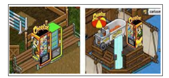
Figure 3. Example of targeted advertisement.

Beyond a presentation that is worthy or technologically appropriate for a digital context, this work has to emphasize the huge amount of advertisements and time consumed in one hour of online play. The reception of so many advertisements is very difficult and the playing time is halved because of disruptions and