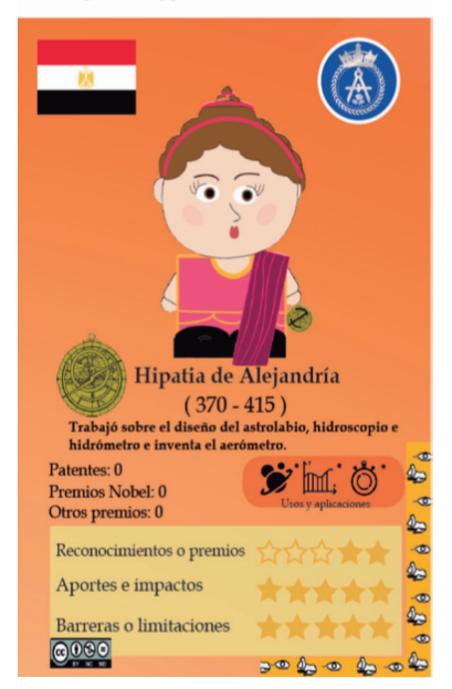
Figure 2. Hypatia of Alexandria's card

of outstanding figures considered geniuses in the world of science through didactic material. This material was designed with relevant information on the contributions of the characters and their recognitions through simple images that allow a guick association with their contributions. The contribution of this work is evident in two aspects: characterization of animated scientific characters highlighting them through allegorical details of their work, context and period in which they lived, as well as developments and postulates of their work. All this was done preserving criteria of pleasant, simple and colorful figures that allow children to identify with them. The other contribution focuses on the design of standardized biographical cards enriched with information about the characteristics of the character and designed with high graphic content that allows the assimilation of information in an easy and pleasant way. Academic discussions and debates focus on new technologies, but we should not leave out spaces for academic and social sharing, the proposal of collectible cards provides information in a very short reading time, so that children know, internalize and participate in scientific knowledge through play. Symbols, icons and graphic representations of the scientific world are the components with which scientific curiosity is to be motivated and generated.