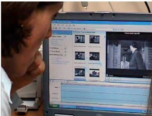
Figure 1: A student works with Windows Moviemaker to analyse sequences from Psycho

This project involves 13-year-old students analysing Hitchcock's celebrated slasher movie. In practical terms, they are provided with the film footage imported into Microsoft's free editing software, Windows Moviemaker. Because Moviemaker automatically splits long footage into brief clips, the students are faced with a screen full of small sequences (figure 1). They are then able to categorise these to explore themes, ideas (such as the fear inspired by horror films), characters, film grammar (they can sort all the close-ups, for instance), and so on. They are then asked to produce an oral presentation accompanied by a Powerpoint show featuring images, moving image sequences, sound files, script extracts and notes.