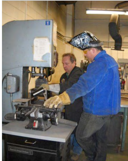
Student at SAIT Welding Program during a Welding shop procedure.

Regarding students' time management and workloads, half of the surveyed students stated the online capability of the course helped them to manage their time more effectively «most of the time». Five of them managed effectively their time sometimes. One of them said he managed effectively his time always.