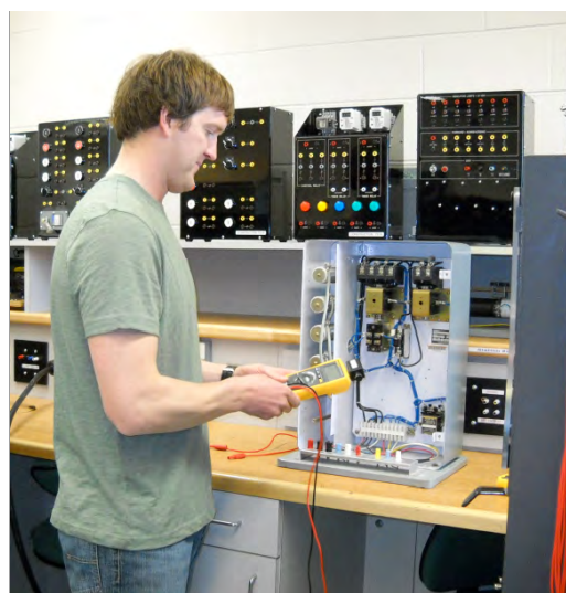
Student at SAIT Electrician Program practicing in the lab.

Instructors' pedagogic views are decisive when they use new technologies in teaching. For example, Bates (2000) underlines that new technologies need different teaching approaches and an understanding of