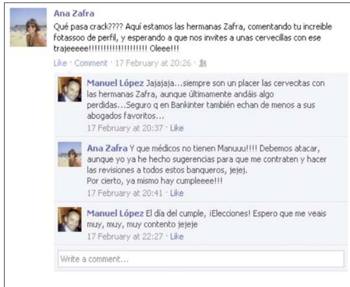
Image 2. Screen shot of user wall. Case 2.

of friends, in order to create a better reputation within the social network (this is so among younger profile users or among those who use the social network as an extension of their professional lives). Many conversations revolve around the same person, reinforced by image (different, changing profiles photos).