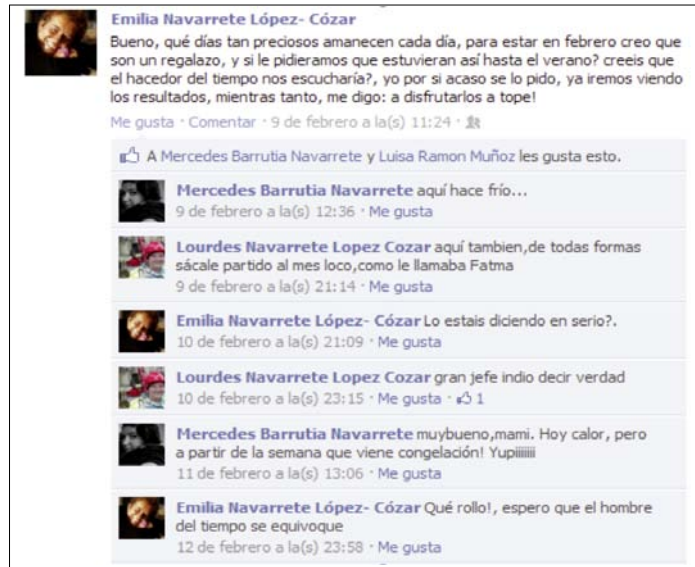
Image 1. Screen shot of user wall. Case 1.

The scarce participation of User 3 and the tone of his communication messages correspond to the profile