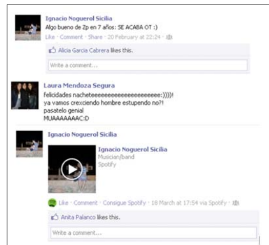
Image 3. Screen shot of user wall. Case 3.

As an example, we present a visual representation of the users' discourse. The graph is shaped as a network, with nodes and edges. The particular user's